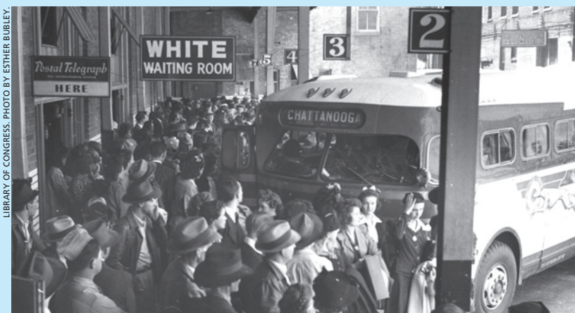
People waiting for a bus at the Greyhound bus terminal in Memphis, Tennessee, September 1943.

This preliminary discussion sets the stage for students to begin their case study of Project C in which citizen’s challenged Birmingham’s discriminatory segregation ordinances. In the activities that follow the initial discussion, students examine the ordinances and related photographs and, for homework, read and summarize a background essay on the Project C protest campaign. They then examine primary source materials to learn about young people’s participation in the protests. The lesson ends with a culminating writing activity that can be used as an assessment.