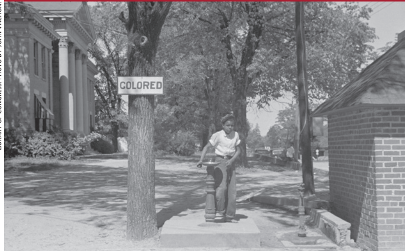
A drinking fountain on the county courthouse lawn in Halifax, North Carolina, April 1938.