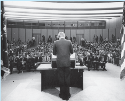
President John F. Kennedy addresses reporters at a press conference in the State Department Auditorium, Washington, DC, August 10, 1961.