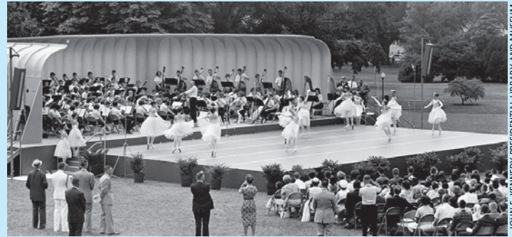
First Lady Jacqueline Kennedy's Fourth Musical Program for Youth at the White House, Washington, DC, August 6, 1962.

"Congress shall make no law ... abridging the freedom of speech ..."