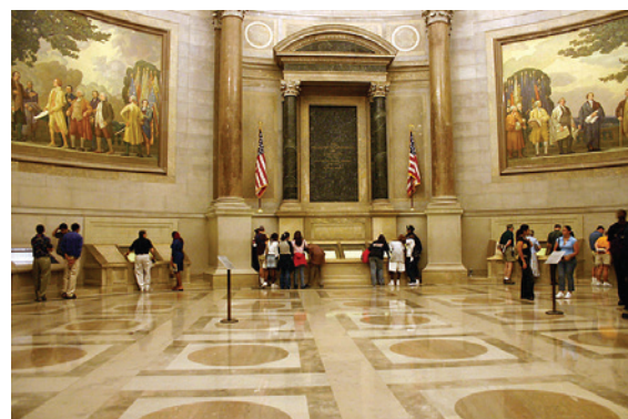
Rotunda for the Charters of Freedom at the National Archives (NARA) in Washington, DC. Displayed here are the Declaration of Independence, the Bill of Rights, and the US Constitution.

For more information about the Charters of Freedom at the National Archives, visit museum.archives.gov/founding-documents . ★