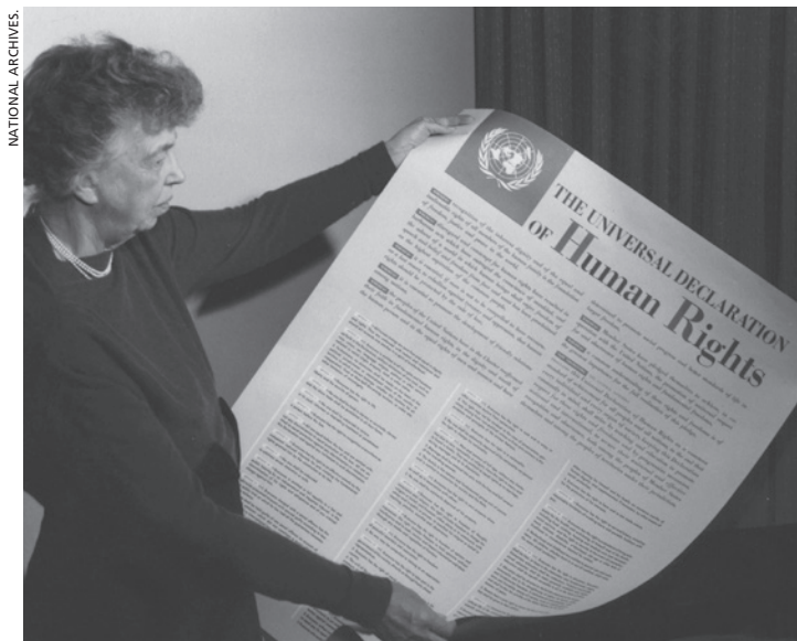
Eleanor Roosevelt holding the Universal Declaration of Human Rights, Lake Success, New York, November 1949.