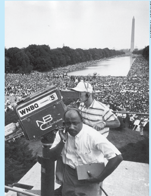
The March on Washington for Jobs and Freedom in Washington, DC, August 28, 1963.